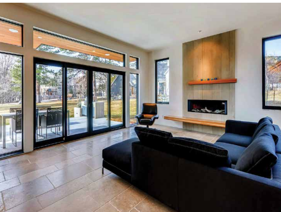
Top: The ground floor has a sunny, simple open concept floorplan and promotes an easy indoor/outdoor lifestyle.