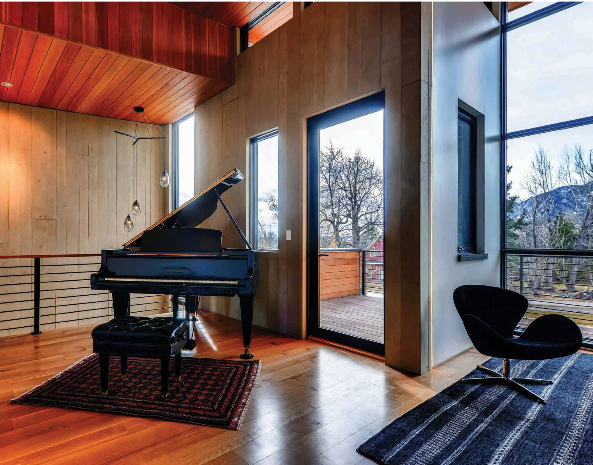
Above: An acoustically tuned music room with 14-foot-high ceilings connects with three bedrooms upstairs. The light fixtures are hand-blown glass.