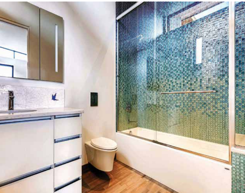
Top: The exterior material palette includes board-form concrete, Douglas fir and stucco for a distinctly Colorado contemporary feel.